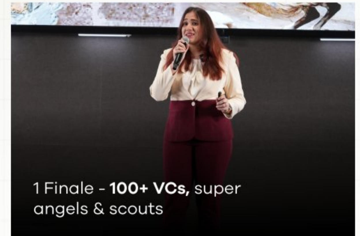
1 Finale - 100+ VCs, super angels & scouts