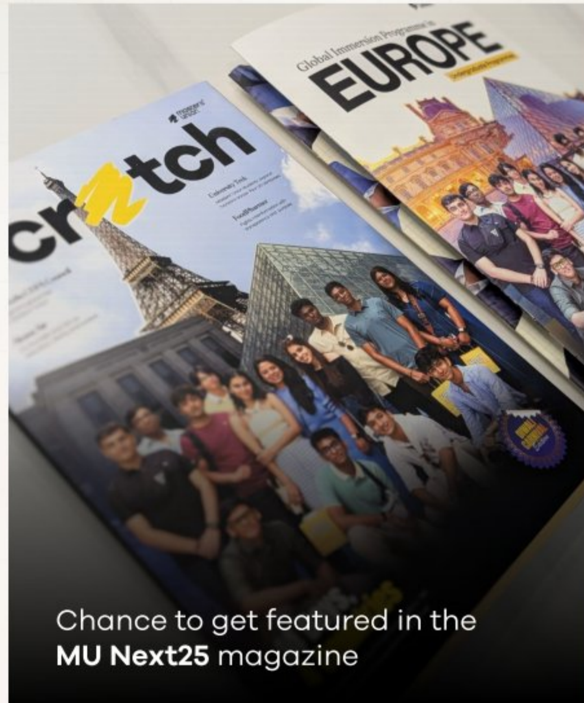
Chance to get featured in the MU Next25 magazine