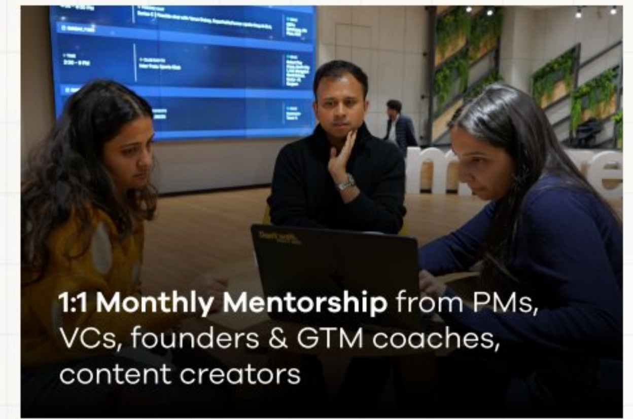
1:1 Monthly Mentorship from PMs, VCs, founders & GTM coaches, content creators