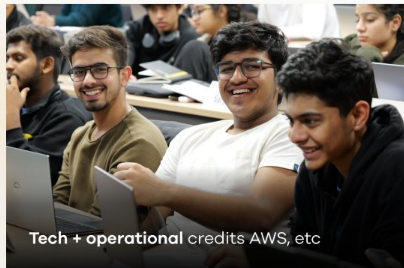
Tech + operational credits AWS, etc