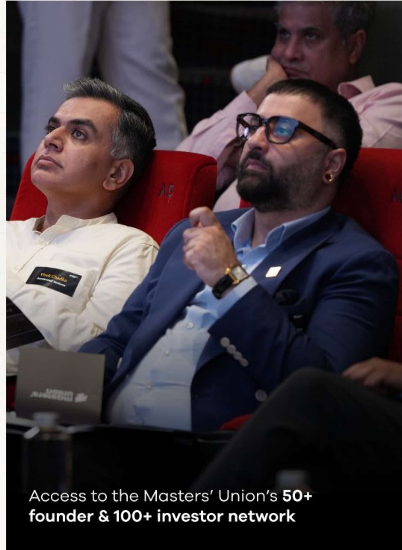
Access to the Masters' Union's 50+ founder & 100+ investor network