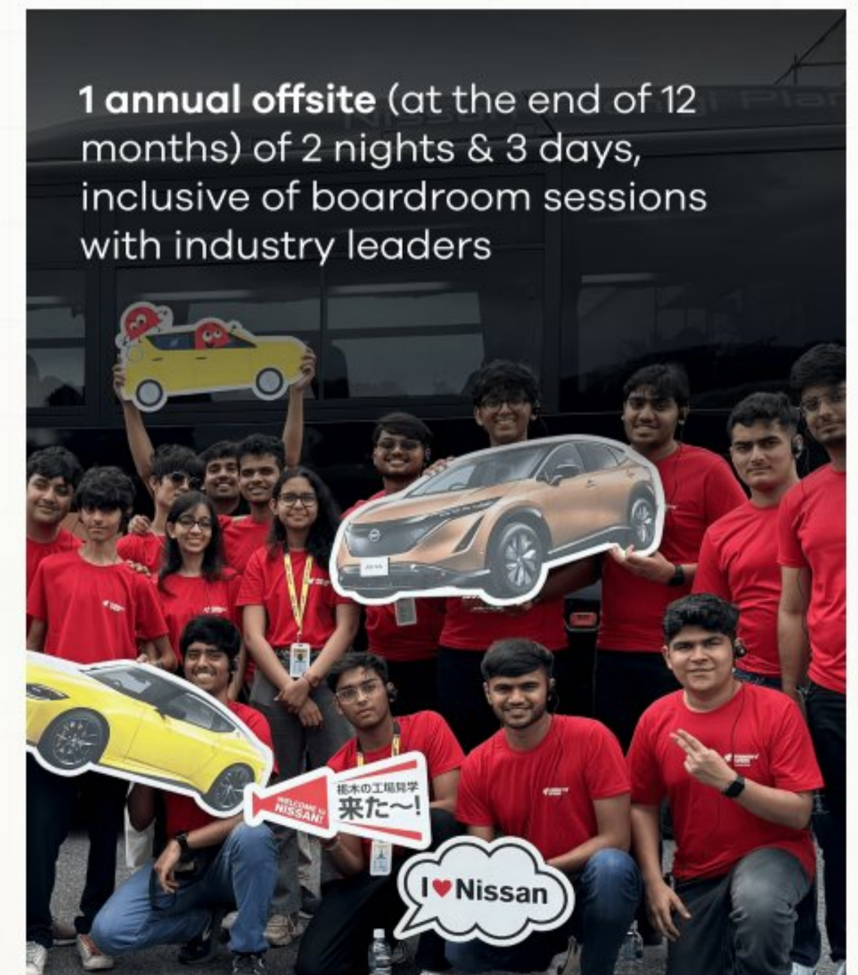
1 annual offsite (at the end of 12 months) of 2 nights & 3 days, inclusive of boardroom sessions with industry leaders